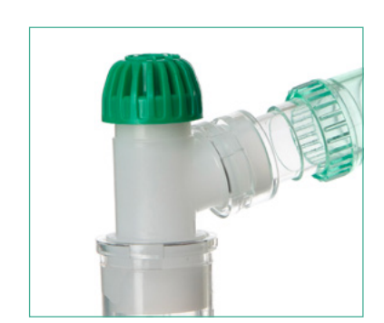
Critical Care • Breathing Systems for Critical Care